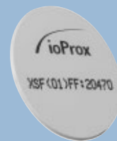
Enlarged to show detail