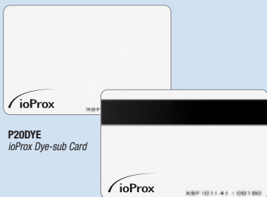
P20DYE ioProx Dye-sub Card